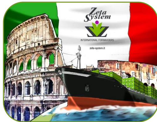
Before goods leave EU