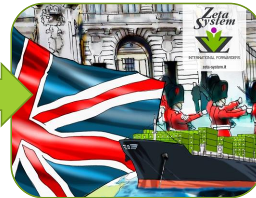
When goods arrive to UK